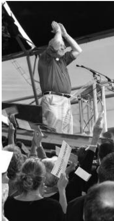
Bishop Richard and the Xpression05 crowd at Portman Road

The campaign is run by the Global Call of Action Against Poverty (GCAP) a worldwide alliance of national campaigns working to tackle poverty around the world.