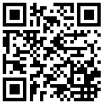
Bansfield Benefice QR code