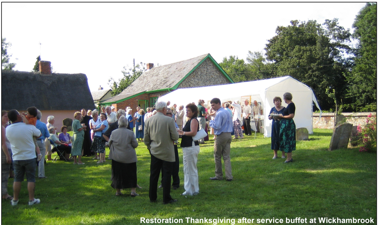
Restoration Thanksgiving after service buffet at Wickhambrook

01284 386942/ 01473 298504 archdeacon.david@stedmundsbury.anglican.org